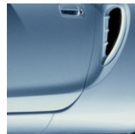
Paradise Blue Metallic with Black fabric or Tan leather interior